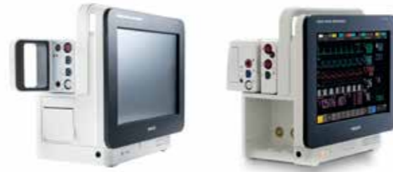
The IntelliVue MX450 (left) uses multi-measurement modules with primary measurements. The IntelliVue MX500 (right) adds the possibility of adding additional measurement modules.

The monitors also have built-in Advanced Clinical Solutions that provide tools to summarize and visualize complex clinical data and their interactions. Multiple streams of information come together in one, intuitive view.